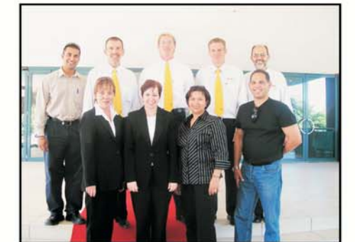
The NamPower delegation at the Mmabatho Convention Centre with the Celsius Team